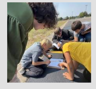
With a beautiful week of weather, there was a lot of learning going on outside!